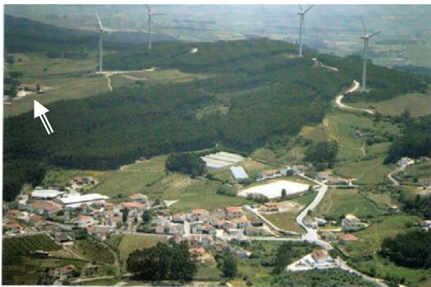
Figure 3. Farm of Family R. isolated on upper left (arrow) with the four wind turbines.

The second case is more recent. Family R. lives on a horse- and bull-breeding farm, located in a zoned, rural agricultural area, 1 hour north of Lisbon. Family R. consists of mother, father, 12-year-old son, and 8-year-old daughter. In November 2006, 4 wind turbines (2MW each) were installed around Family R.'s farm, at approximately 322m, 540m, 580m and 643m from the residential home. The distance to the stables is less than to the residential house (See Fig. 3).