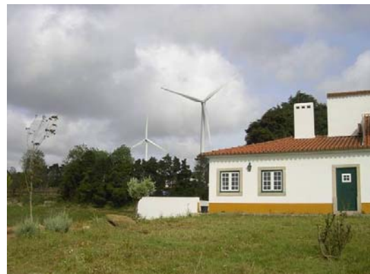
Figure 4. Farm of Family R., with the two of the turbines at approximately 322m and 643m from the home.

The detail and accuracy of acoustical measurements greatly depends on the type of equipment available. Both noise assessments were obtained in 1/3 octave bands and in linear dB (not dBA), and all equipment was duly calibrated.