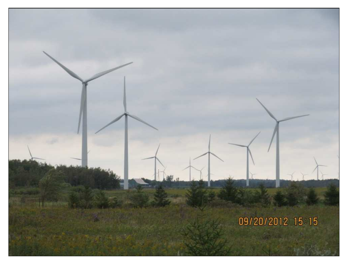
Hwy 89, Melancthon Township, Ontario, Canada