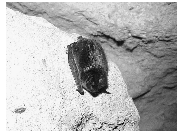
FIG. 3. — Eptesicus nilssonii searching for night-active invertebrates on vertical cliffs at Hoburgen, Gotland. A number of bat species are able to feed in this way before they take off from land. At sea, bats also hunt insects at wind power turbines near the blades and on the vertical tower sides.

At 1 departure site, Hoburgen on Gotland, bats of several species were seen landing on the almost vertical cliffs facing the sea, where they crawled around and fed on night-active